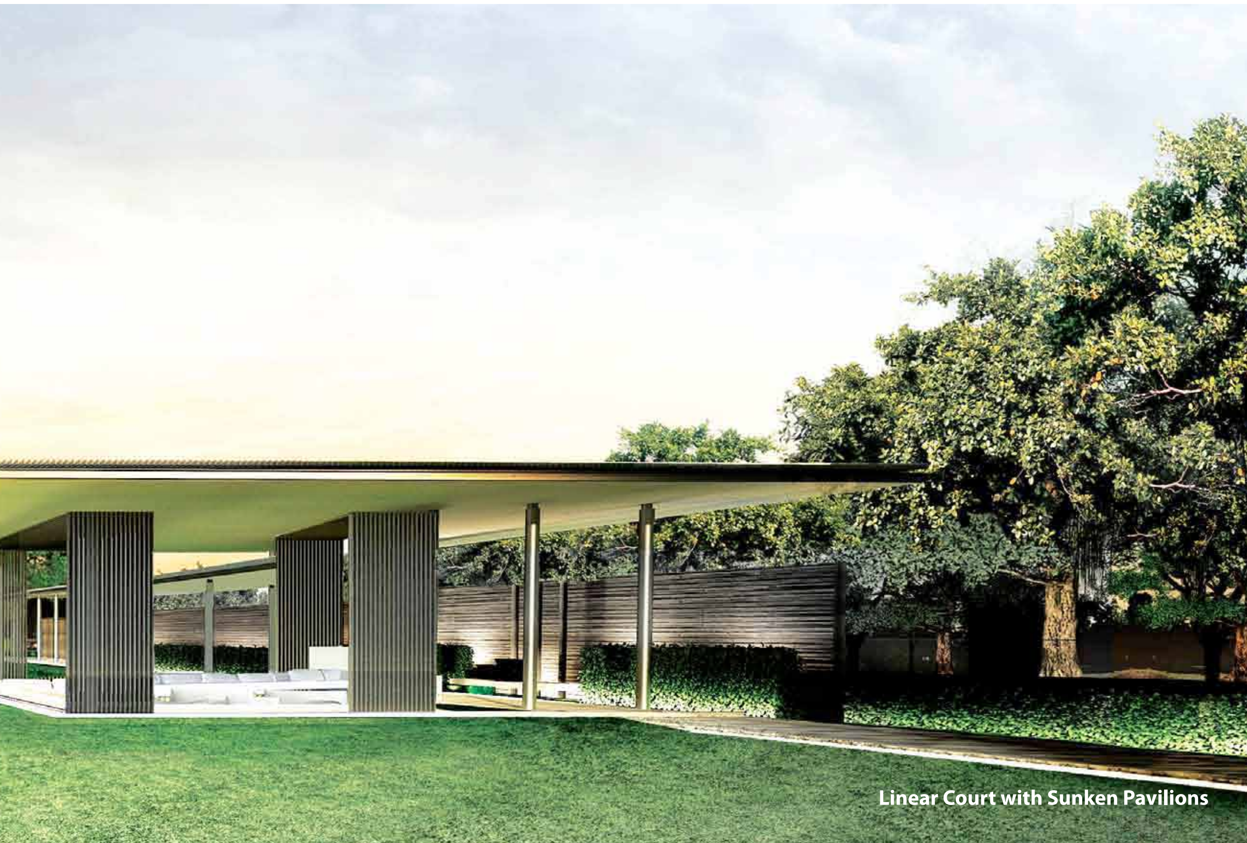
Linear Court with Sunken Pavilions

At Ireo Gurgaon Hills, the internal landscaping blends beautifully with the stunning external surroundings. Your serene abode comprises of manicured lawns, scenic pathways and a variety of water features and activity spaces that have been incorporated into a raised platform groundscape. Striking features of the landscaping include large sit-out pavilions and gazebos that frame these luxuriant lawns, providing an oasis of tranquil and contemplative spaces for a quiet sit-out or even community activities. Formal colonnades accentuated by the abundant greenery provide sheltered walking paths from every residential tower to the centrally located clubhouse. Truly, taking a walk will be a treat for the senses at Ireo Gurgaon Hills.