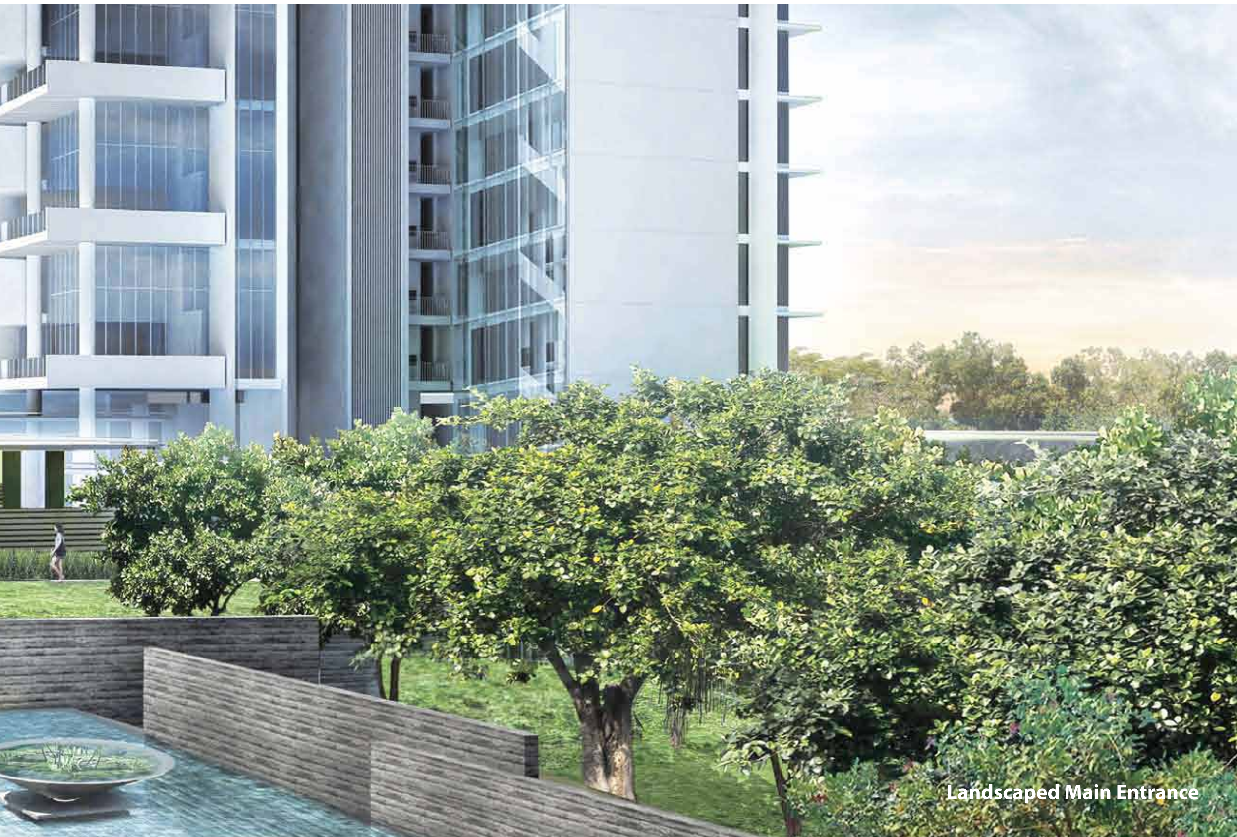
Landscaped Main Entrance

The resort-like main entrance is crafted in a way that its sunken ring road will keep internal vehicular flow out-of-sight while providing easy access to designated drop-off points for each tower. These dedicated drop off points are surrounded by exclusive sloped lawn arrival gardens, that then lead into the grand, fully furnished, air-conditioned entry lounge of each tower with its 20 ft high ceiling. Three sides of this magnificent lobby space has a glazing that opens into views of the surrounding shimmering water bodies and green lawns; creating the visual effect of almost bringing this landscape into the lobby area.