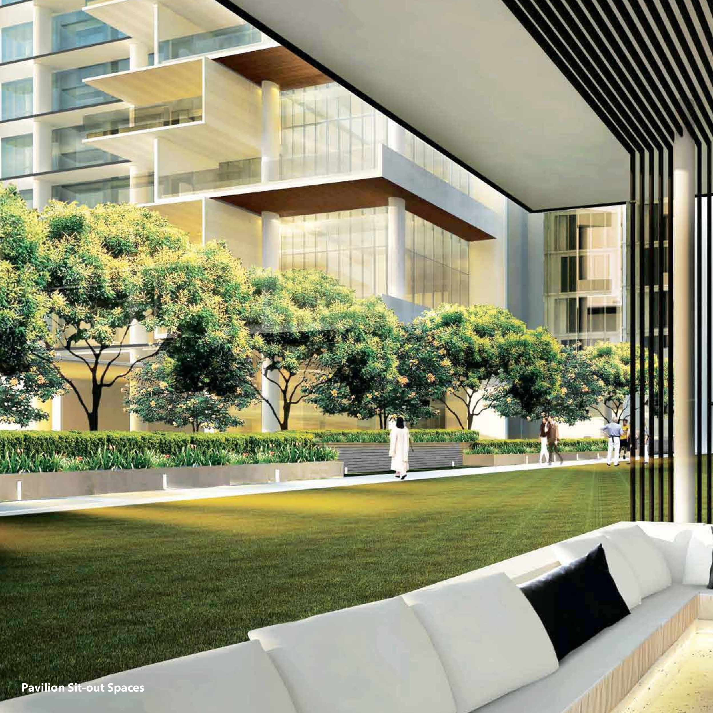
Pavilion Sit-out Spaces