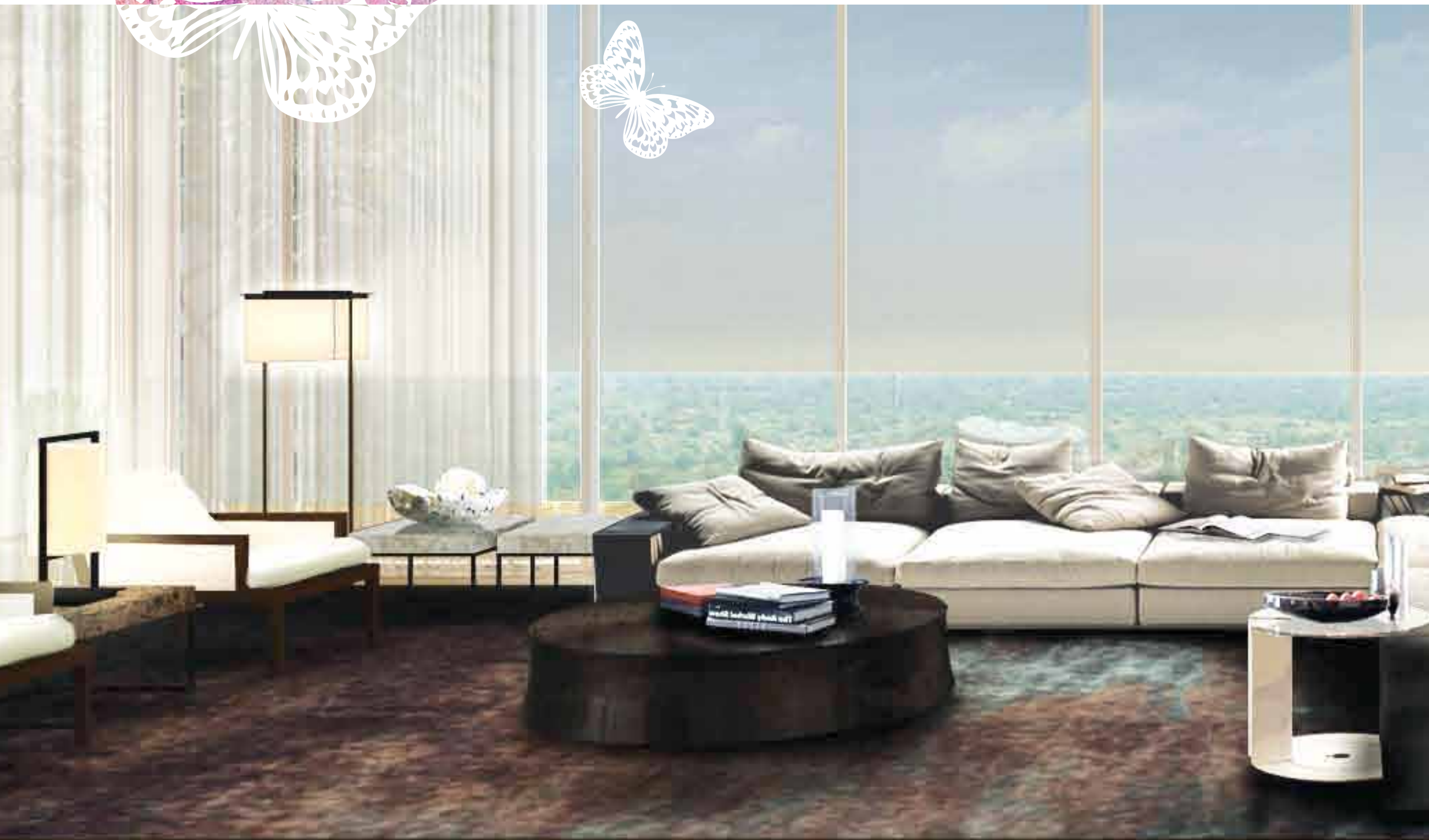
Double-volume Living Dining Room