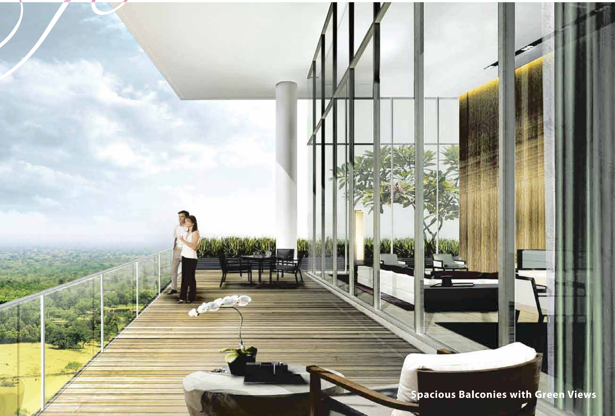
Spacious Balconies with Green Views