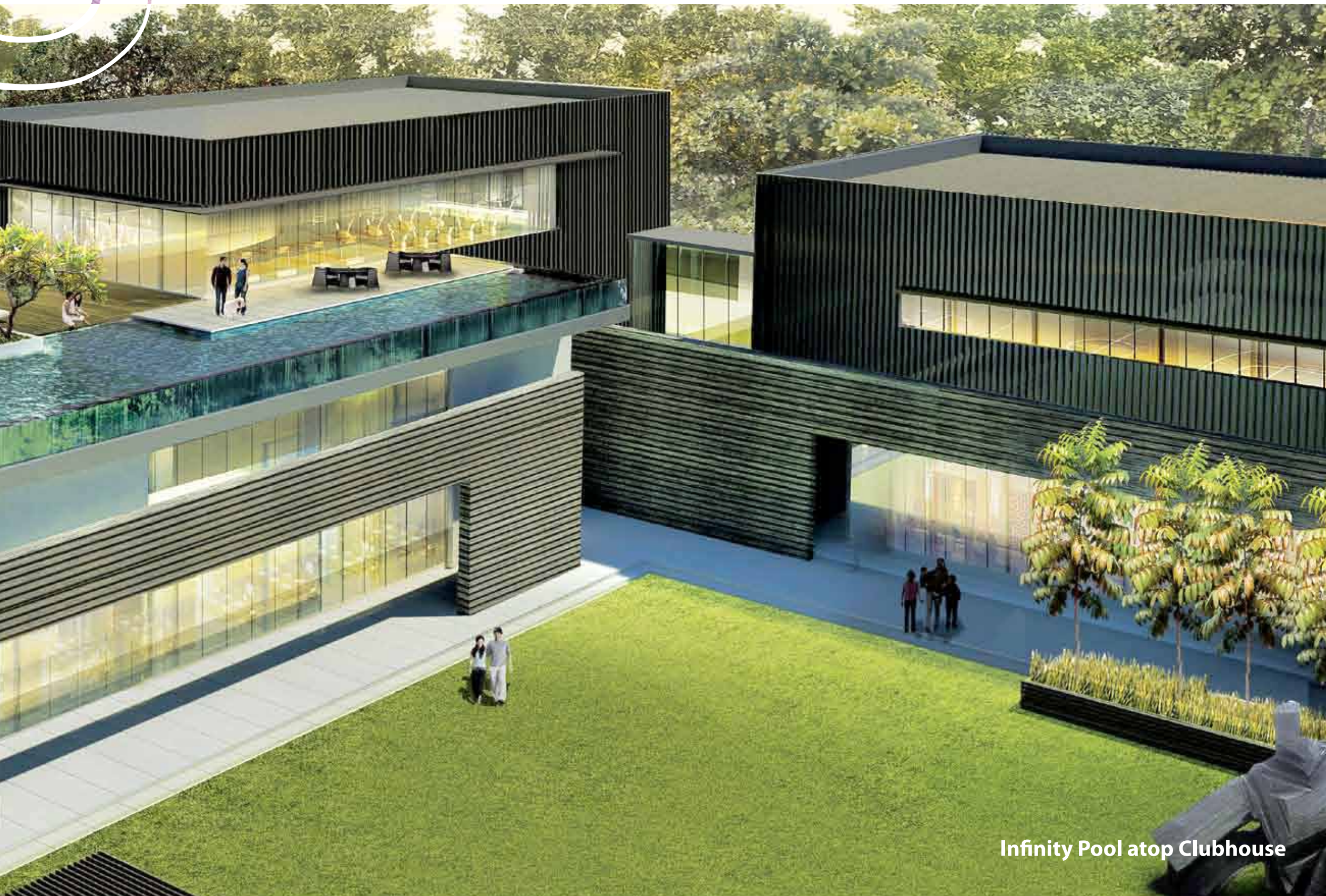
Infinity Pool atop Clubhouse